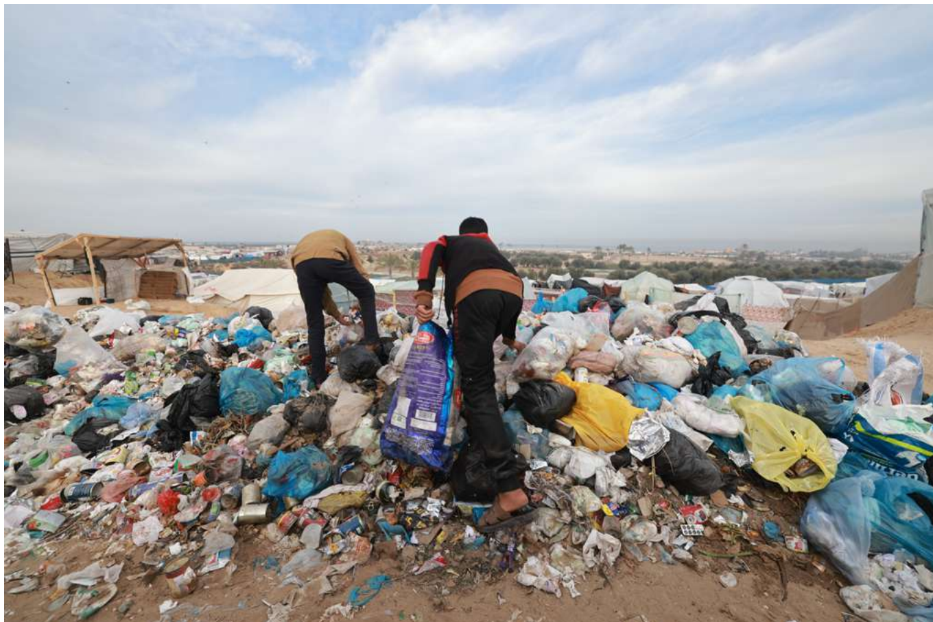
Photo: People in Rafah search through rubbish for food or other salvageable items